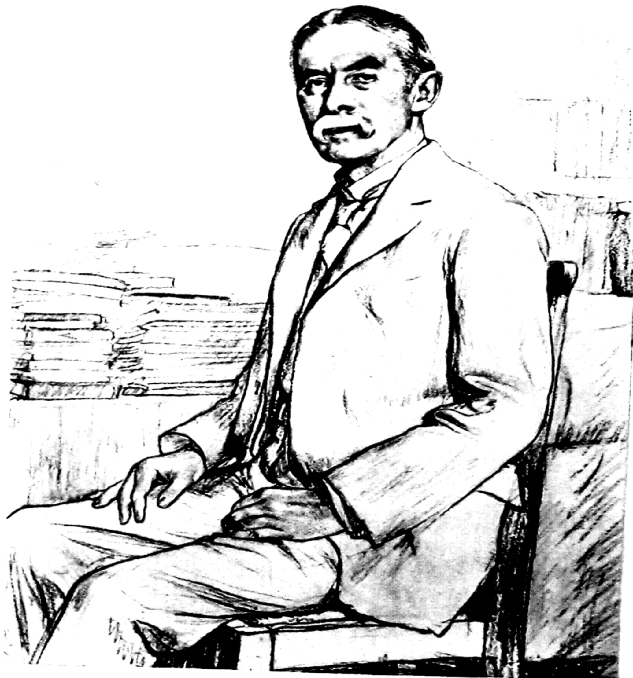
A. E. HOUSMAN